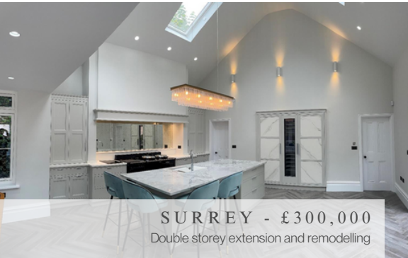
SURREY - £300,000 Double storey extension and remodelling