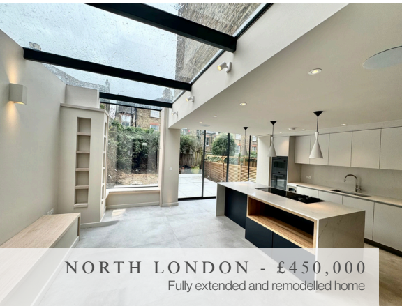
NORTH LONDON - £450,000 Fully extended and remodelled home