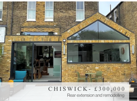
CHISWICK - £300,000 Rear extension and remodelling