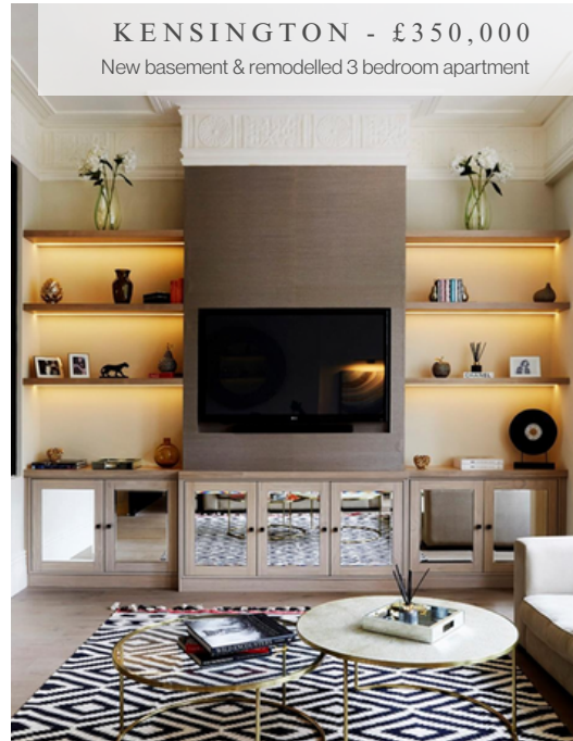
KENSINGTON - £350,000 New basement & remodelled 3 bedroom apartment